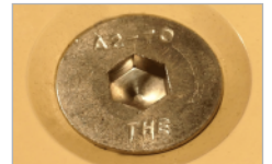
Outdoor grade stainless steel base bolt*