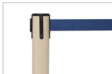
Standard 11' / 3.4m belt