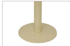
Non rusting aluminum base