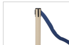
Break for slow, safe belt retraction