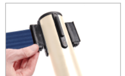
Belt lock to prevent accidental belt release