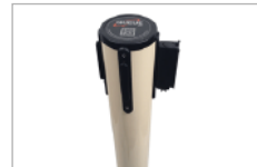
Double powder coated stainless steel post