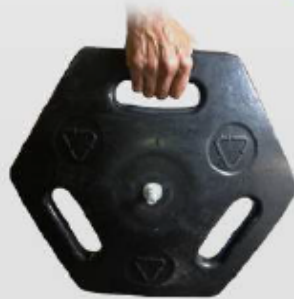
Convenient Carry Handles

WeatherMaster 335 models are fitted with a unique locking device that fixes the belt in place and eliminates sagging.