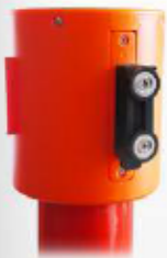
Magnetic Belt Option

Designed for creating long straight barriers or large cordons the 335 model's 35'/10.6m belt requires just a quarter the number of barriers needed with the industry standard 7.5'/2.3m belt. Fewer posts means lower purchase cost, faster set up times and requires less space for transport and storage. WeatherMaster 335 is fully outdoors capable and features our rugged recycled rubber base.