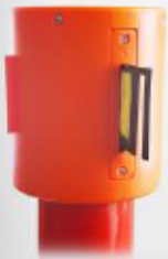
S-Clip Belt Option

Industry Standard 7.5' Belts 17 Barriers