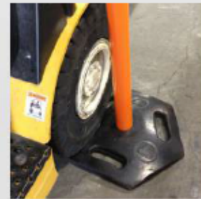
Tough Recycled Rubber Base