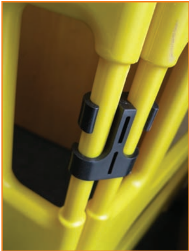
Plastic hinged clips