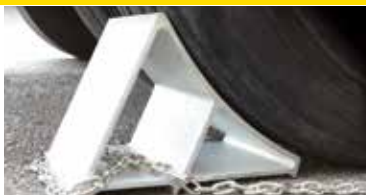
Wheel Chock Safety Systems