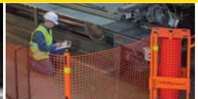
Portable Safety Zone