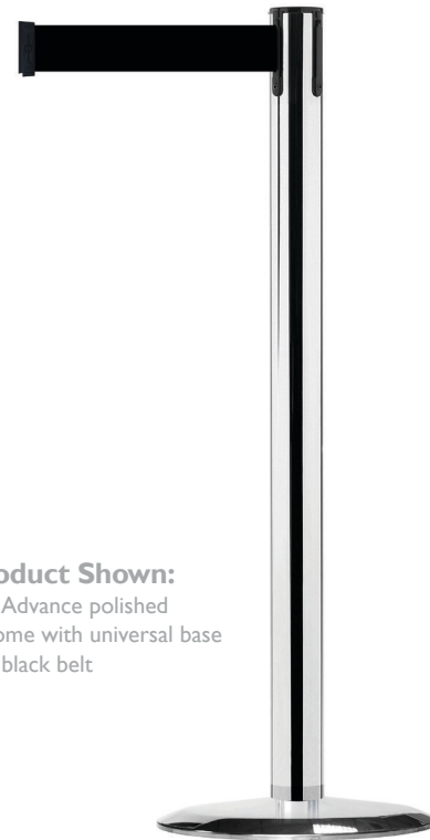
Product Shown: 889 Advance polished chrome with universal base and black belt