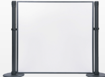
Extra Height Panel