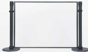
Standard Height Panel