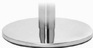
14"/355mm diameter portable base