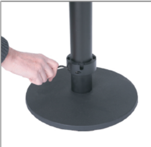
Attach collar to post bottoms