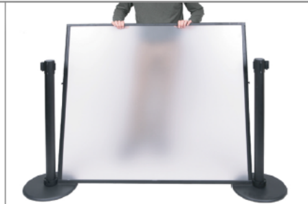
Pivot the panel into place