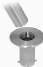
Floor socket for removable mounting