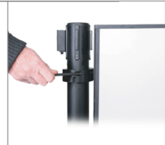
Attach collar to post tops