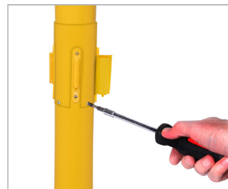
Step 1: Remove post retaining screws