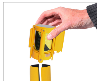
Step 3: Loosen the cassette retaining screws and slide out the cassette