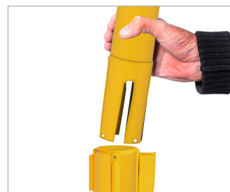
Step 2: Slide off the post top