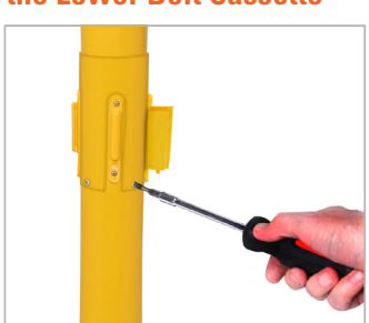
Step 1: Remove post retaining screws