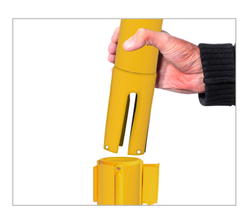
Step 2: Slide off the post top