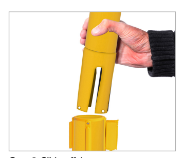
Step 2: Slide off the post top