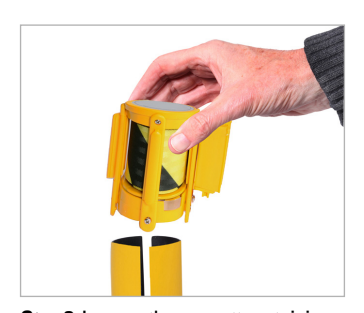
Step 3: Loosen the cassette retaining screws and slide out the cassette

Weight: 20lbs./9kg Belt Widths: 2"/50mm and 3"/75mm Xtra Post Diameter: 2.5"/64mm Belt Length: 8.5'/2.6m and 11'/3.4m