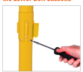
Step 1: Remove post retaining screws